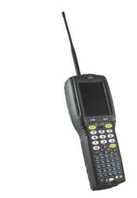
FC300 Handheld Computer

Itron radio technology has taken huge leaps forward in recent years allowing Itron to provide products to meet the rapidly evolving needs of today's utilities. FCS supports two-way radio communications with a new generation of endpoints including the CENTRON Bridge meter, 100W, and 100G Datalogging ERT modules enabling utilities to collect 40 days of time synchronized daily or hourly meter readings. This data can be used to fulfill a wide variety of utility needs and eliminate special trips to the field releasing field service personnel to perform more important tasks. Itron has extended value beyond meter reading with 100T endpoints for monitoring cathodic protection, pressure correction and more. Utilities can also use FCS with radio equipped mobile devices to remotely connect and disconnect service for electric, gas and water. The utility may assign these tasks to specialist employees or perform these tasks automatically as part of existing meter reading operations.