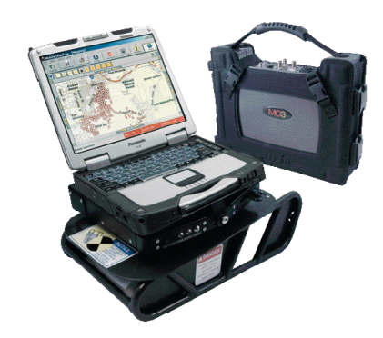
MC3 - Mobile Collection System