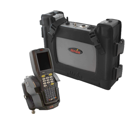
Mobile Collector Lite