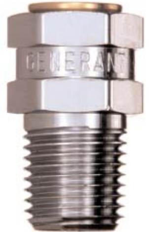
VRV Vent to Atmosphere

(based on sealing selection, see ordering information)