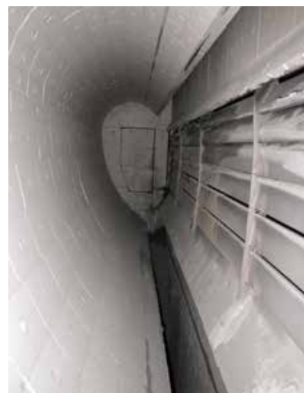
View inside the door of a 17-year-old GI Classifier, which is operating in an abrasive, high-tonnage application. Nearly all of these ceramic tiles are still original.