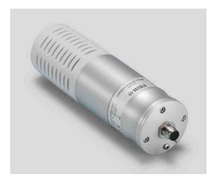
GMP343 for outdoor measurements