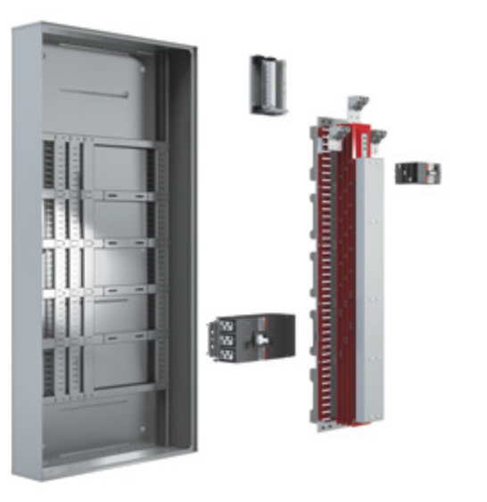
Fig A. The EntellEon platform also includes range of other compatible, pluggable power panel components including SPDs and reduced energy let-through (RELT) switches.

Further, the modular design of the panel enables mixed breaker side-by-side installation. This mix and match modularity of different height and width-sized breakers mounted in the same row simplifies both design and installation. Modular, pluggable breakers also mean any upgrade or changes in power load requirements can be made after the initial order or even initial installation.