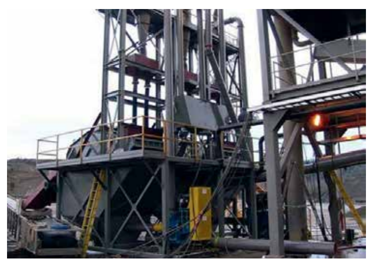
Hydrocyclone tower – HR

Metso has many years of experience supplying all types of crushing, screening, classification, separation, dewatering, conveying and pumping equipment to the aggregate industry.