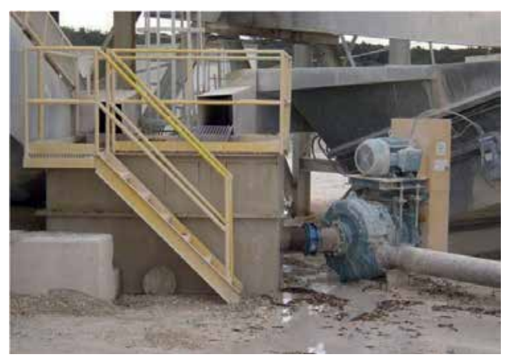
Spiral classifier overflow – HM250