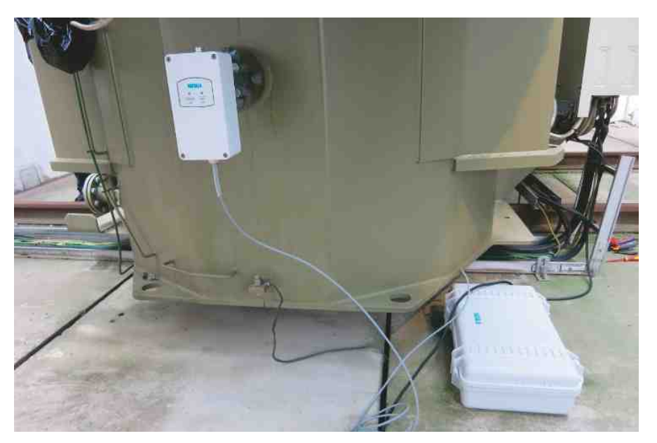
MHT410 prototype installed in instrumentation valve at Vantaan Energia site.

Reference measurement in Vantaan Energy Electricity Networks Ltd. transformer.