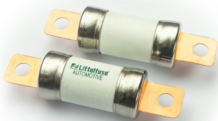
High Current SHEV Fuses